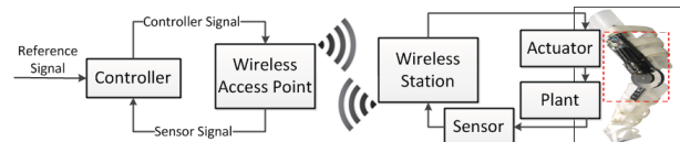
Figure 2: Conceptual block diagram of the human rehabilitation system

explore the channel diversity. Fig. 2 shows the architecture of a wire-free human rehabilitation system at local site. The wireless station and the access point here are Linux boxes, each equipped with Atheros AR9285 Wi-Fi card. The duration of each time slot is set as 500\mu s , so that we can achieve a data rate of 2kHz which is sufficient for a wide range of wireless control applications. In order to provide reliable communication, RT-WiFi utilizes channel hopping and channel blacklists mechanisms to avoid interference, and it supports acknowledgment and retransmission to further improve reliability. Moreover, since the sensors and actuators in WCSs are usually attached at battery-powered mobile devices, RT-WiFi takes an energy-efficient design by turning on its wireless radio only in time slots when transmitting or receiving is scheduled, and it aggressively puts devices in power saving mode to minimize energy consumption.